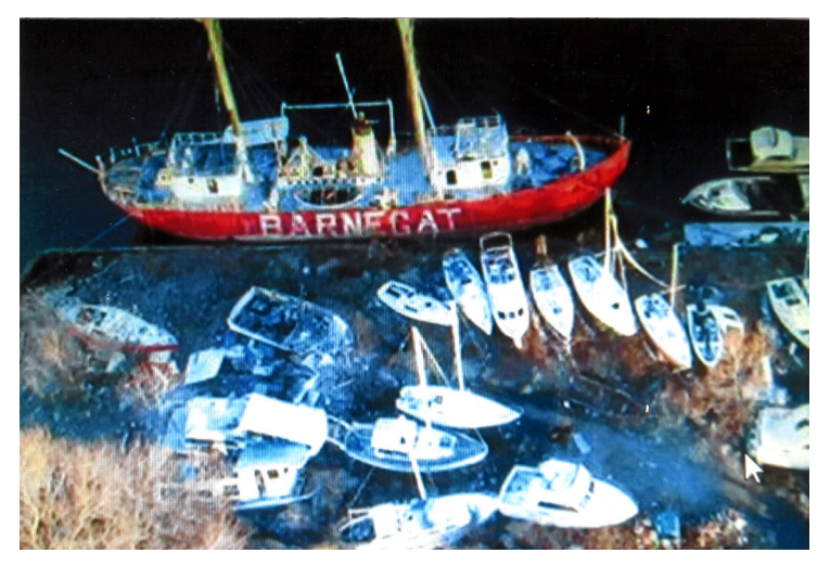
This is now... Trashed Barnegat Lightship in Camden, NJ

I was happy we found the Barnegat. Happy but very sad. Happy that we had found her and that she was still afloat but sad to see her current state of disrepair and to realize her future is bleak at best. The Lightship Barnegat is a 119-year-old icon,